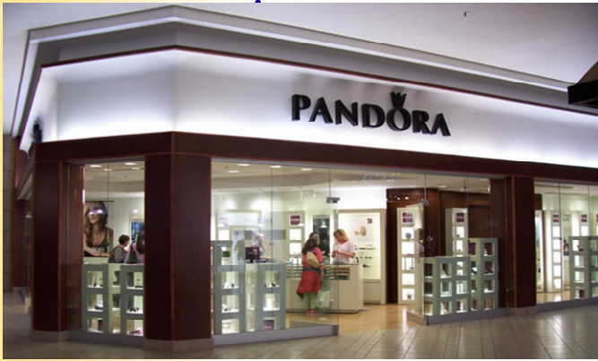
PANDORA exclusive store in the Holyoke Mall in Holyoke, MA

EXEControl Global Solutions is happy to announce that seven retail stores that exclusively sell PANDORA Jewelry are now using EXEControl for their information technology needs. These stores, in New York, Massachusetts and Missouri, join the growing list of EGS